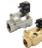
2-way servo-assisted solenoid valves, diaphragm, brass or stainless steel body.