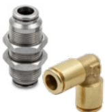
Automatic fittings in unleaded brass Series F-E and F-NSF, tubes from \varnothing 4 to 10 mm, threads from M5 to 1/2".