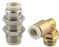
Automatic fittings in unleaded brass Series F-E PLUS and F-NSF PLUS, tubes from \varnothing 4 to 10 mm, threads from M5 to 1/2"