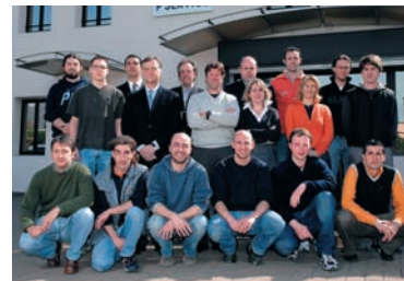
Ballabio, an electric and electronic division was also created. In 1996, the company achieved the ISO 9001 certification. Today, P Service Oggiono has a staff of 25, over 800 active customers and a market coverage close to 15% for pneumatic components.

serving over 300 customers, so they moved into the current site in Oggiono, with 1.000 square meter surface. In 1991, a 600 square meter building was bought in Cassano Magnano, moving the branch from the town to the most industrialized area in the district. In 1995, leveraging the proven experience of the founding partners Mauro Brambilla and Mario Spreafico, the company opened an industrial compressor and compressed air plants division. In 1997, following the acquisition of Fabio