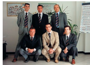
attention to human resources and shares the goals of the entire Group.

development. These ten years have seen a constant growth of turnover and market shares. P Service Treviso has a strong focus on service and assistance, as well as research and development, in order to guarantee the full satisfaction of its customers. In line with Metal Work's corporate philosophy, P Service pays great